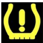
Diagram 1. Example of a TPMS warning lamp

The TPMS warning lamp (see diagram 1) can operate in many ways depending on the vehicle type. If it is clear that the lamp indicates a system malfunction it is a fail. If it indicates that one or more of the tyre pressures is low it is not a fail.